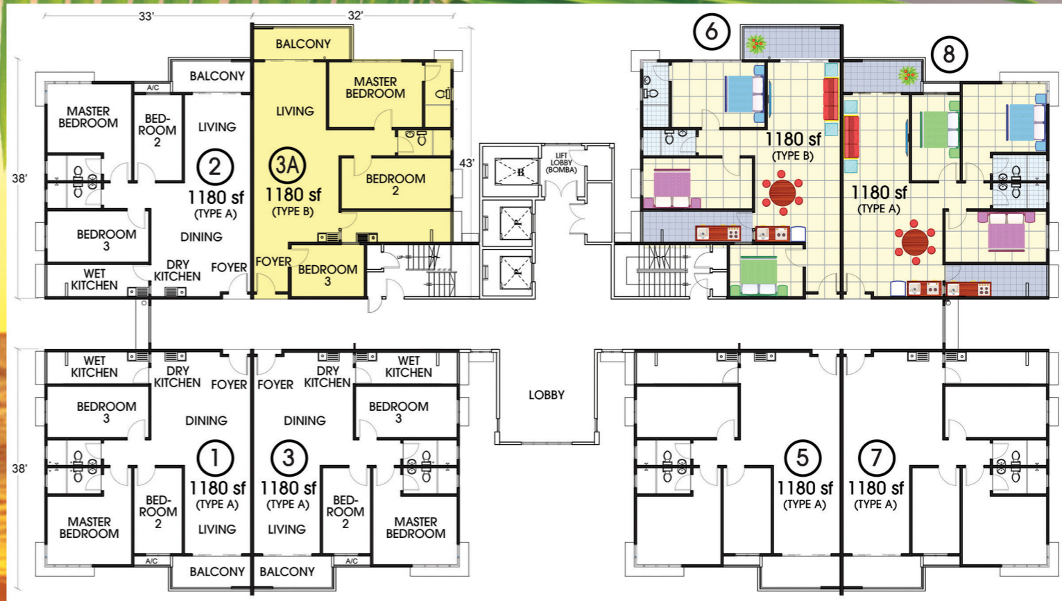
1至16樓平面圖 1ST - 16TH FLOOR PLAN