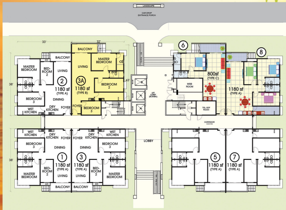
底樓平面圖 GROUND FLOOR PLAN